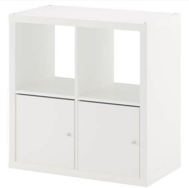
Kallax 4x4 manual.